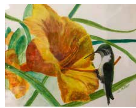
Yellow Hibiscus and Hummingbird by Jeani Miller

portraits—depicting not only physical features but also how people perceive themselves. In contrast, she finds comfort in painting animals, as "the animal doesn't judge."