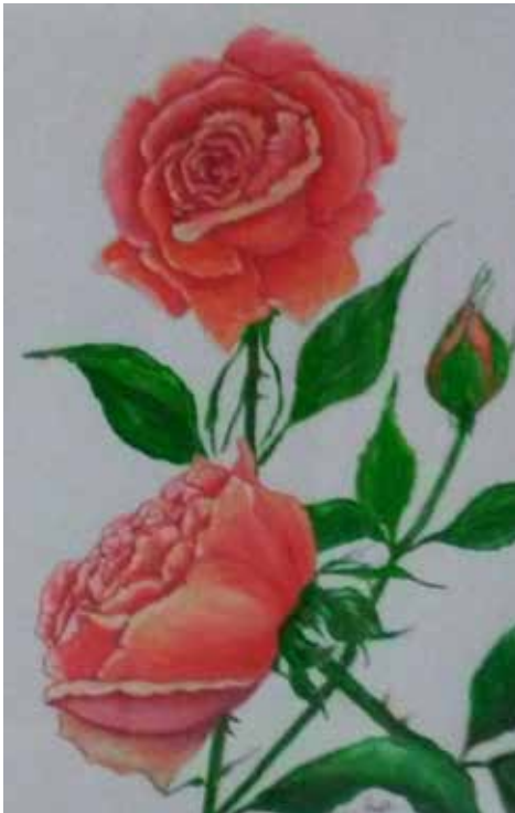
Watercolor - A Rose, Circle of Life

Heritage Festival and later coordinating eight years of Art in the Park, held both outdoors and inside the Guild's gallery and studio.