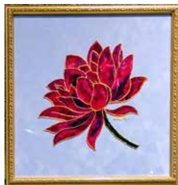
Glass Paint - Lotus Flower