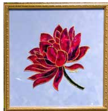
Glass Paint - Lotus Flower

Much of her artwork has been gifted to others. She believes each piece finds its way to the person who will appreciate it most, and she describes herself with characteristic humility as “a jack of all trades and master of absolutely nothing.”