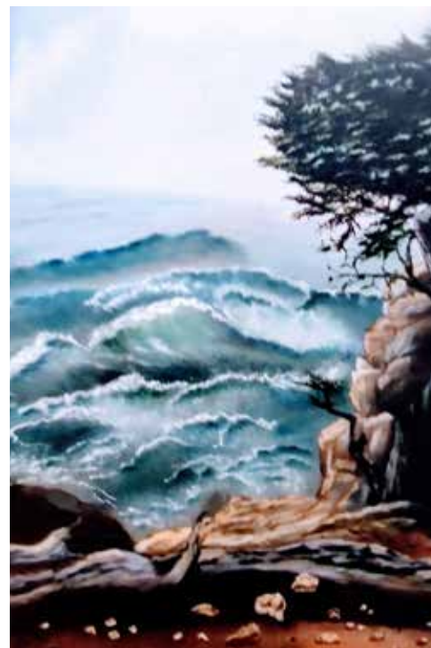
Oil - California Dreaming